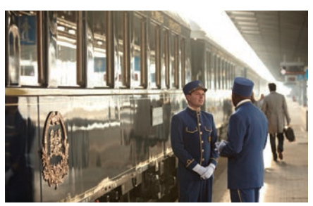
On the platforn

The Belmond Hotel Cipriani is a legendary hotel in an exquisite location, set amid its own beautiful gardens on the island of Giudecca.