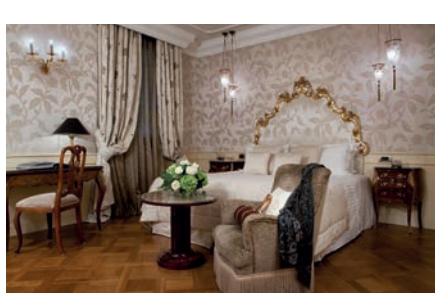
Deluxe room at Baglioni Hotel Luna

Guests can take advantage of the private motorboat service which is on call 24 hours a day to ferry them across the lagoon to St Mark's Square, a journey which takes just five minutes. Elegantly decorated bedrooms overlook San Giorgio Island, the Casanova Garden or the lagoon, while each of the three restaurants enjoy a lovely location. The hotel is an excellent option for those who don't want to stay in the centre of Venice.